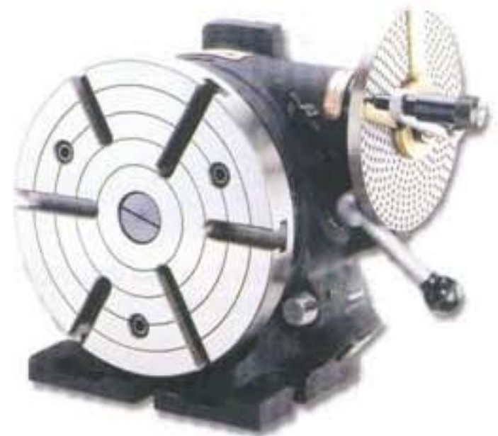
The state of CS-8 fitted with Face Plate & Dividing Plate

This index combines the advantages of the Super Index with those of a worm-gear index. When mounted on a milling, boring or other machine tool it can carry out single-purpose indexing and indirect indexing using the worm-drive mechanism. Disengaging the worm drive the 24-notch master plate permits 2,3, 4,6,8,12 and 24 dividing in the same manner as the Simple Index. When the chuck is removed, the unit can be used as a horizontal and vertical type rotary table. The operating handle to rotary table worm gear reduction ratio is 1:90. The operating handle collar is graduated 'in one minute, and readings down to ten seconds can be set on the vernier.